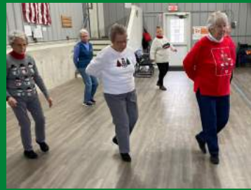
Line Dancing and Other Dancing Classes