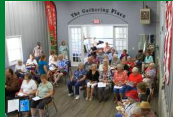
Building Wide Celebrations