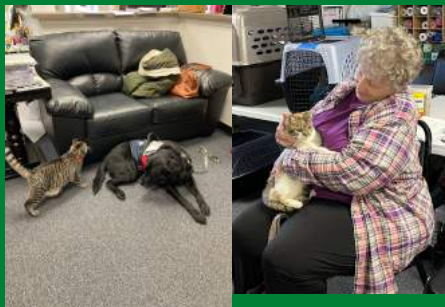
Pet Therapy Visits