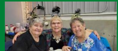
Make lasting Friendships