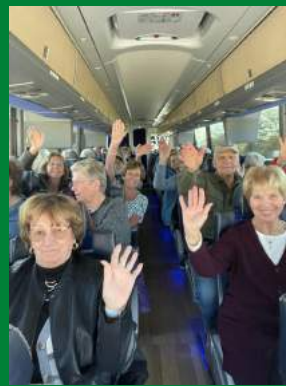
Day & Multi-Day Bus Trips