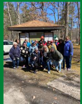
Offsite Hikes and Walks

We do all these classes and activities and so much more! We also have many Grief Support, Mental Health Support, and Caregiver Support Groups. We also love to get suggestions about new classes and activities that we can offer. We hope you will join our Gathering Place Family!