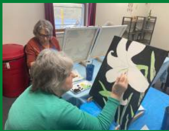
Arts & Crafts

What types of classes and activities are offered? We have a full schedule of daily activities and programs, and we add new classes and programs every single month. We provide a monthly printed newsletter which is mailed out to our members and includes a calendar and a description of everything that is offered at The Gathering Place. In addition, members will be able to go to either of our Centers and take advantage of classes and events at either location!