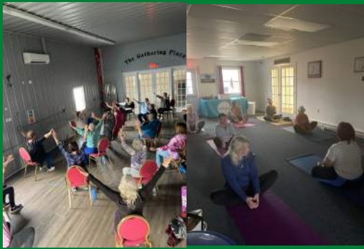
Yoga & Chair Yoga Classes