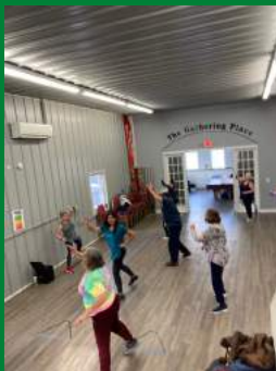
Zumba Gold Classes